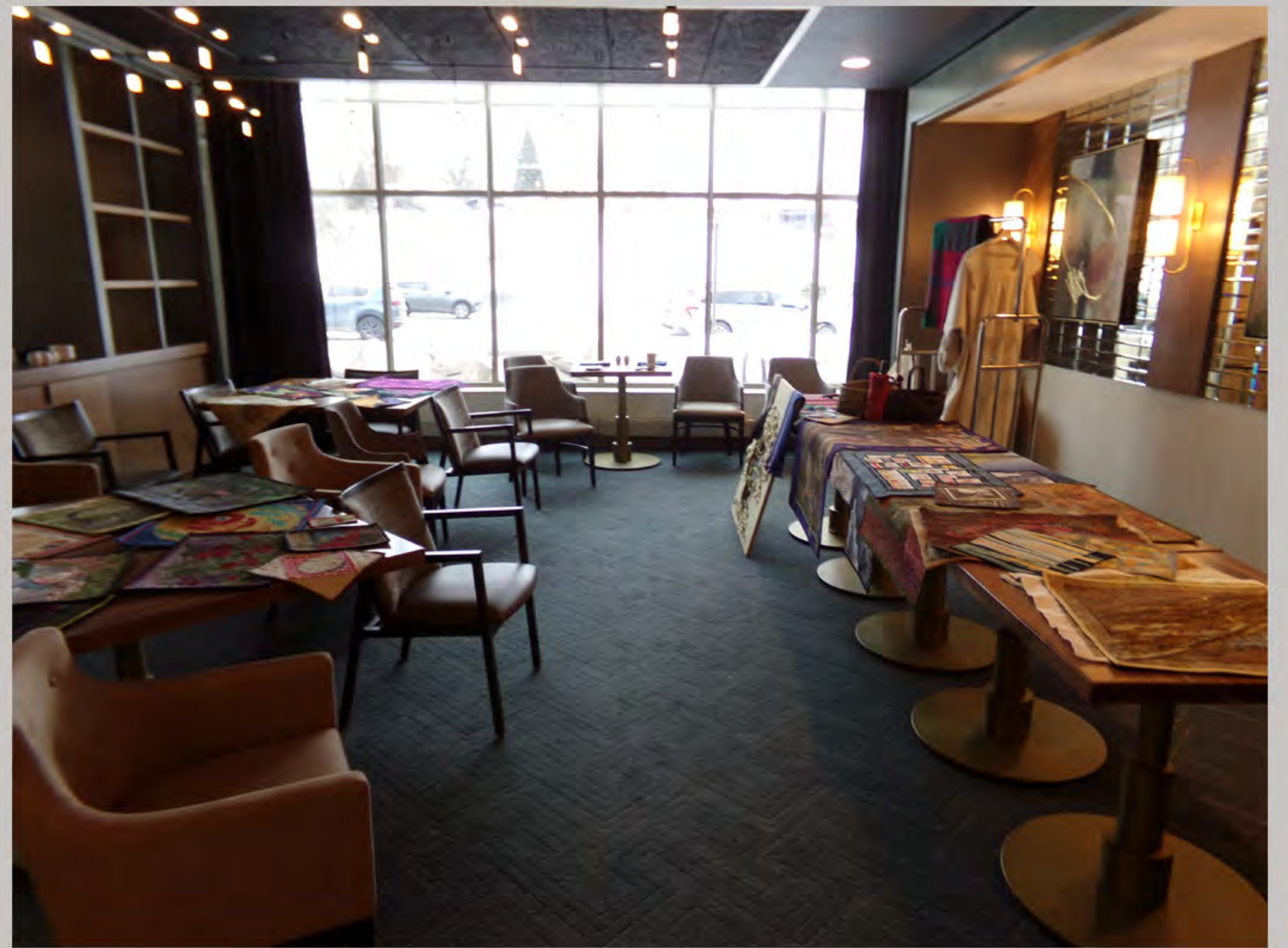
Resident-created fiber art works are displayed for the community to enjoy.