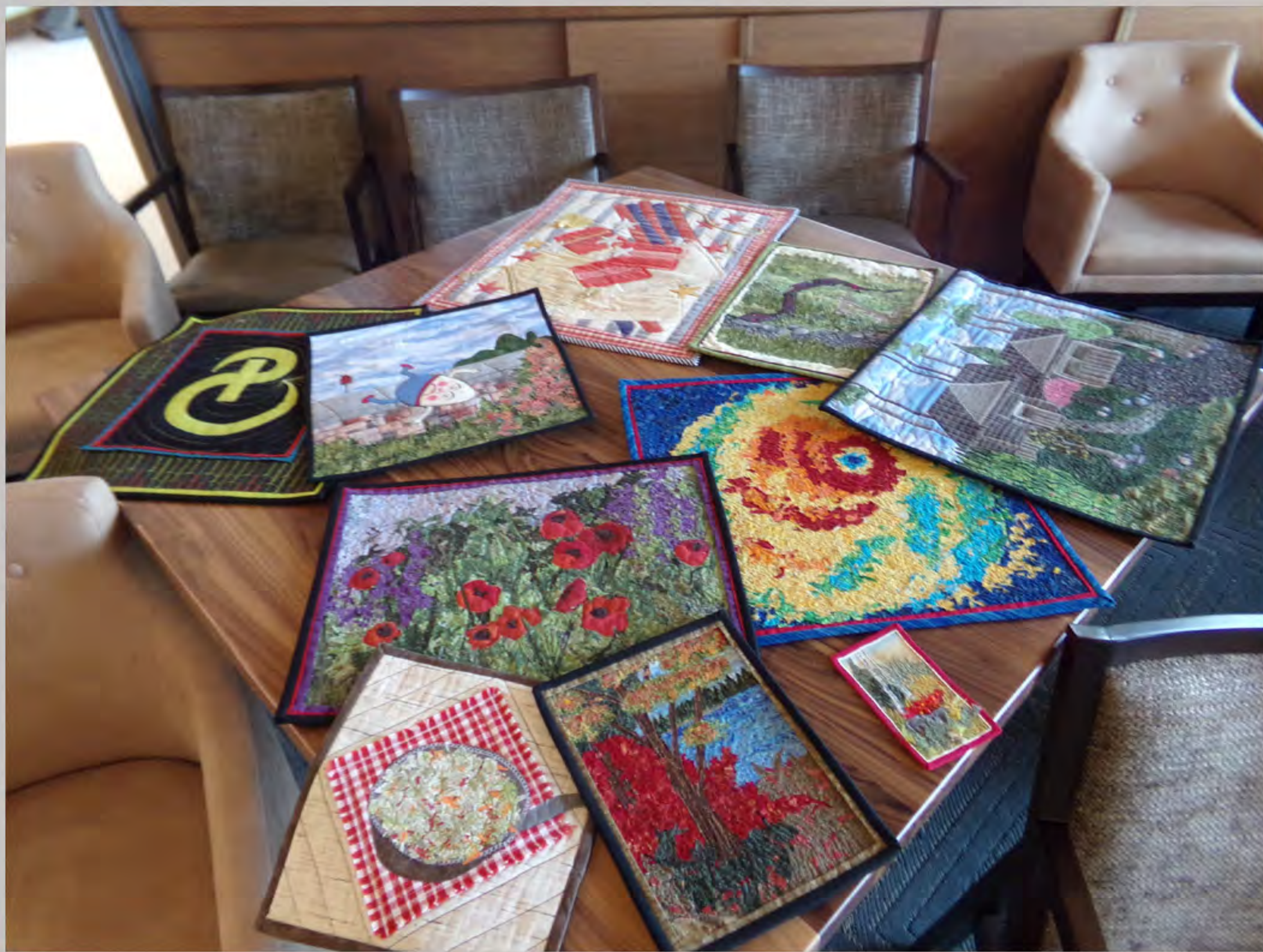
A Revel Creek resident happily introduced us to her fiber art works.